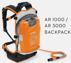
AR 1000 / AR 3000 BACKPACK

Power up with an AR backpack battery or AP battery & adapter.