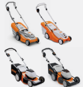
LAWN MOWERS RMA 235 / RMA 339 / RMA 460 / RMA 460 V