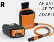
AP BATTERY + AP TO AR ADAPTER